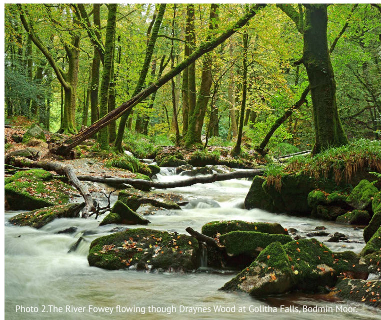
Photo 2. The River Fowey flowing through Draynes Wood at Golitha Falls, Bodmin Moor.

Trelonk , a landowning business looking to boost resilience through diversification, was awarded £6k for a seed press to produce nutrient-dense oil for nutraceutical and cosmetic use. By recapturing nutrients the seed press provided the missing link between the primary production of oilseed and the retailing of end products, creating a new – closed loop – product range.